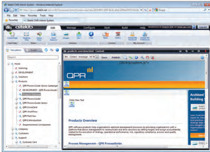
Sitekit CMS: Easy to use control panel